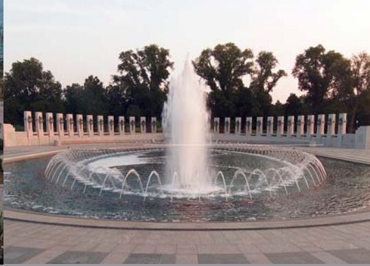
National World War II Memorial